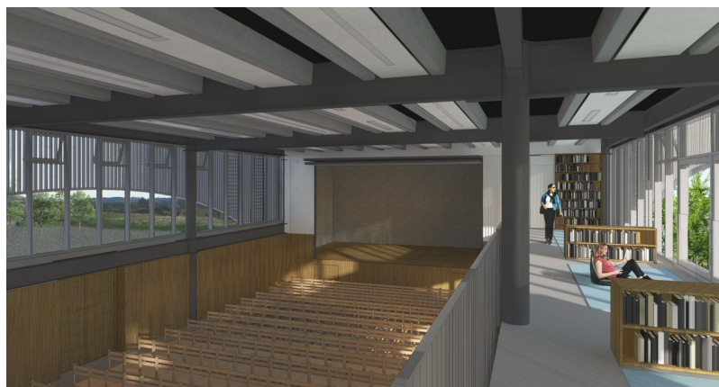
Concept design: Hall