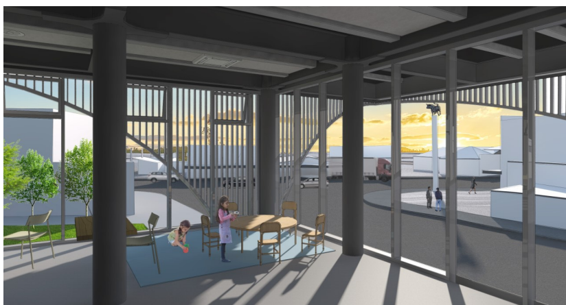
Concept design: L Hub