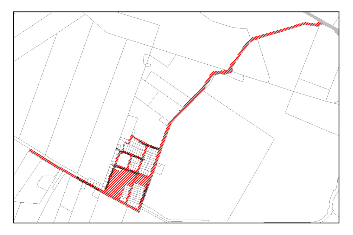
All prohibited areas are shown as shaded in red on map.