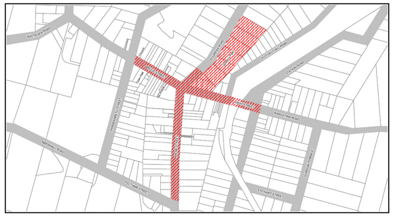
All prohibited areas are shown as shaded in red on map.