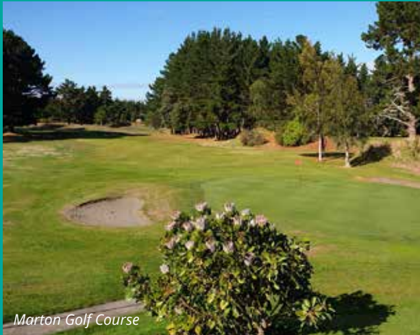
Marton Golf Course