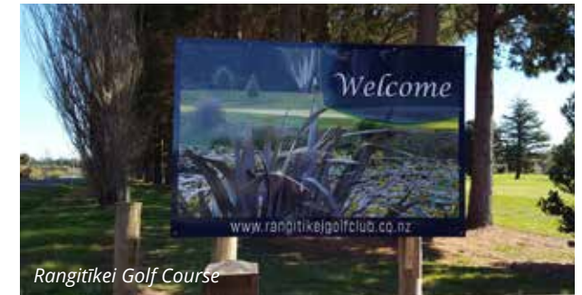
Rangitikei Golf Course