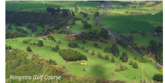
Rangitira Golf Course