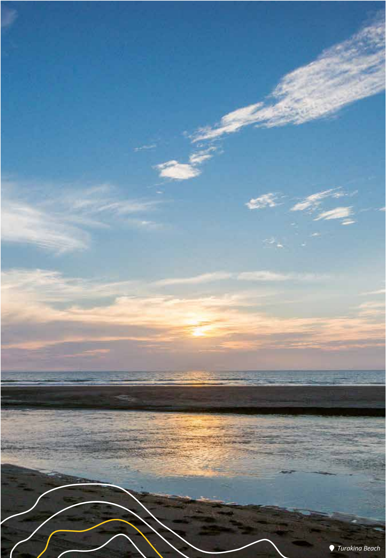
📍 Turakina Beach