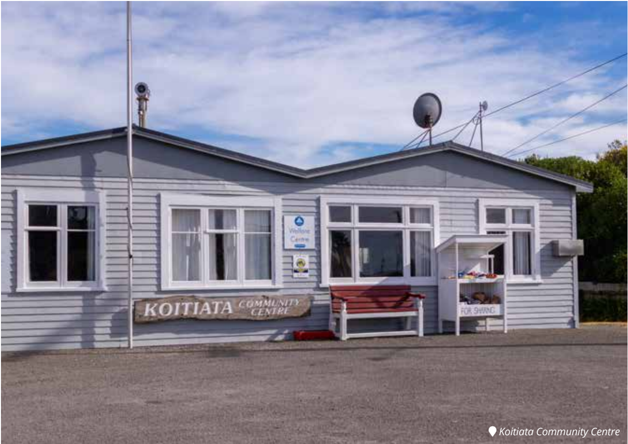
📍 Koitiata Community Centre