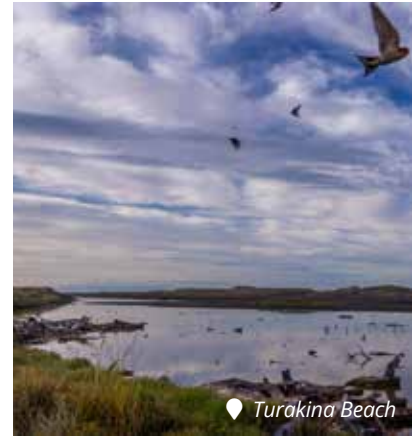
📍 Turakina Beach