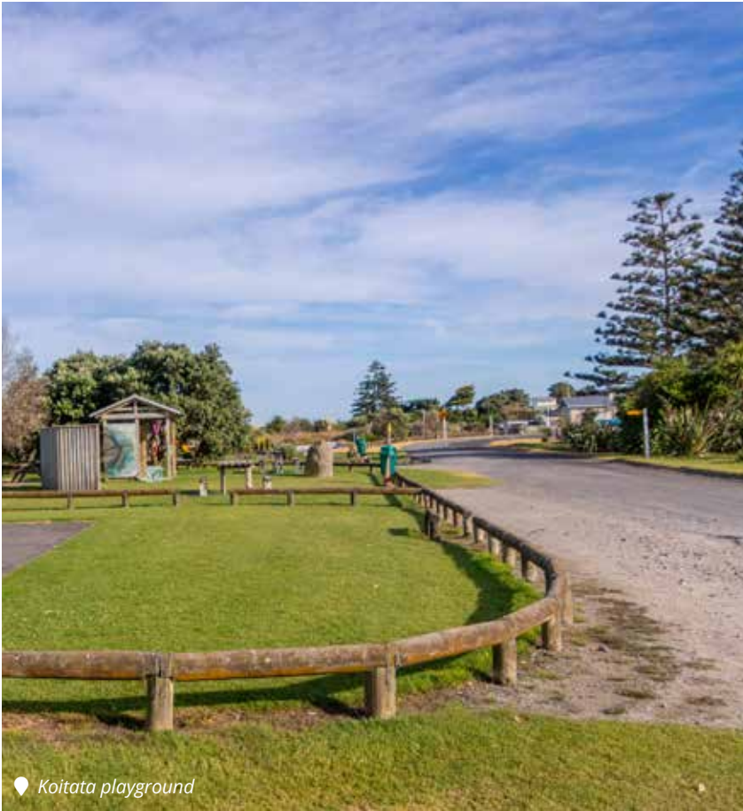
📍 Koitata playground