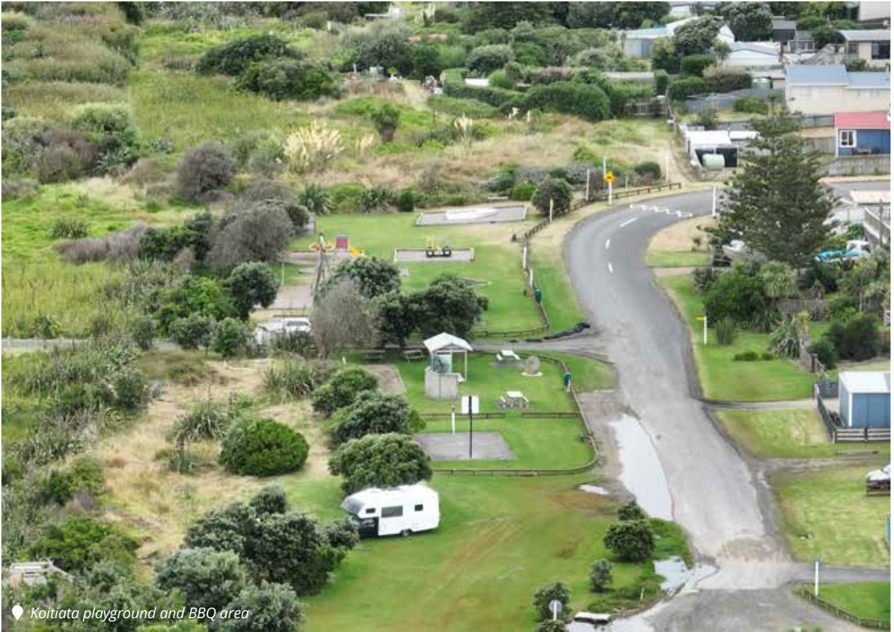
◆ Koitiata playground and BBQ area