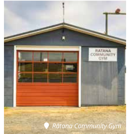
Rātana Community Gym