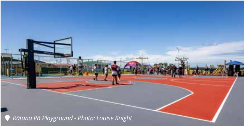
Rātana Pā Playground - Photo: Louise Knight