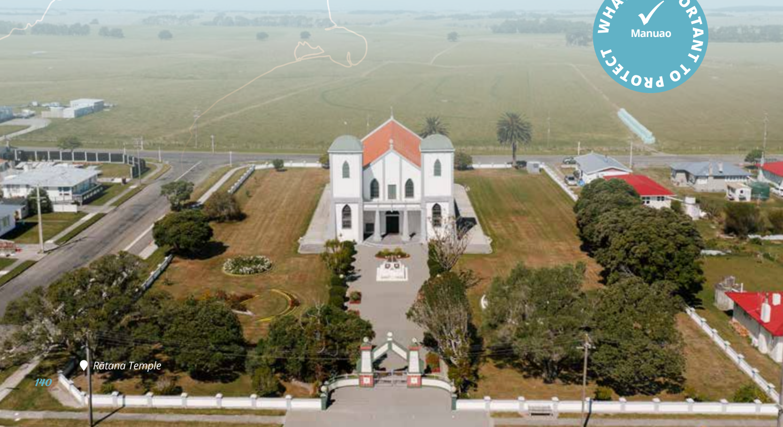
📍 Rātana Temple