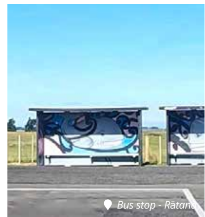
Bus stop - Rātana

“Bus for people that can’t afford transport.”