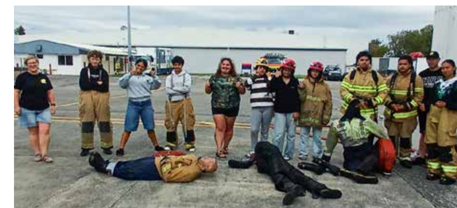
Rangatahi taking part in the Whānau First Youth Fire Safety course in Palmerston North.

But now we have heaps of mulch of our own, so we can use this instead of having to buy it, and this helps to reduce some costs.