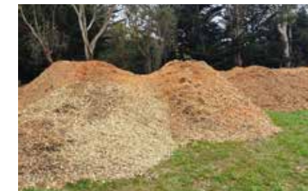
New mulch made from smaller trees and branches.