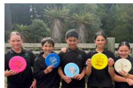
Students from Taoroa School were the first to try the new Disc Golf course.