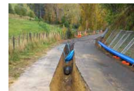
Work on the Taihape water network continues (Ruru Road)