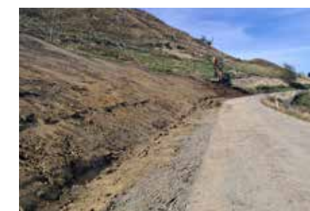
Hillside along Waiaruhe Road