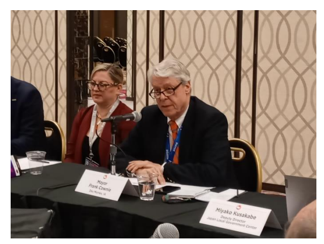
Mayor Cownie of Des Moines, Mayors for Peace U.S. Vice-President, speaking to the International Affairs Committee on June 4, 2022

In its new resolution, the USCM "calls on the President and Congress to exercise restraint in U.S. military engagement in Ukraine while maximizing diplomatic efforts to end the war as soon as possible." The resolution "calls on the U.S. and the other nuclear-armed states parties to the NPT [Nuclear Nonproliferation Treaty], at the August 2022 10th Review Conference of the Treaty, to implement their disarmament obligations by committing to a process leading to the adoption no