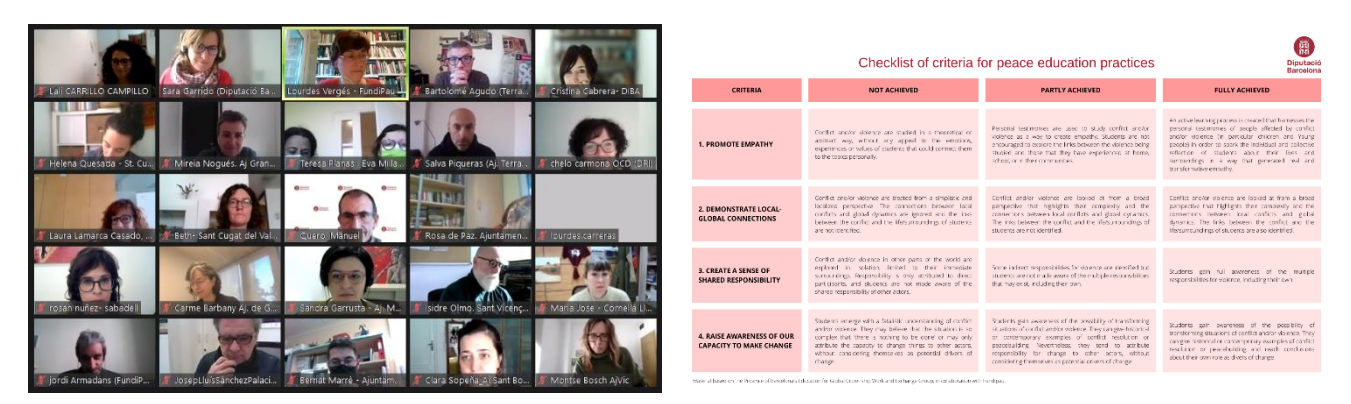
Meeting of the Education for Global Citizenship Work and Exchange Group

Development cooperation staff from the following municipalities participated in the session: Castelldefels; Cornellà de Llobregat; El Prat de Llobregat; Granollers; Manresa; Mataró; Sabadell; Santa Coloma de Gramenet; Sant Boi de Llobregat; Sant Cugat del Vallés; Sant Pere de Ribes; Sant Vicenç dels Horts; Terrassa; Vic; Vilafranca del Penedès, and Vilanova i la Geltrú.