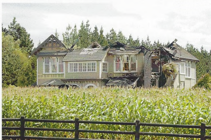
The aftermath of the fire at The Manor Cafe near Sanson.