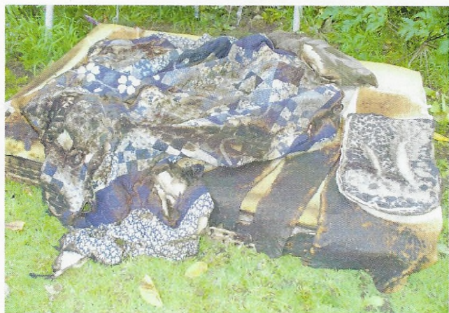
Unsafe electric blankets are the cause of too many fires.