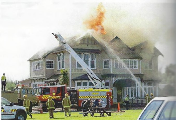
The 2009 fire at The Manor Cafe near Sanson was spectacular and challenging.

Despite some very big calls through the year, the number was down with only 96 recorded.