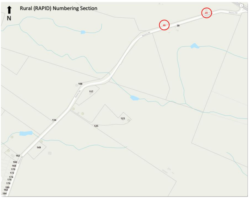
Figure 2: Rātana Road - Rural numbering section.

4.3 The rural numbering begins at the intersection of Rātana Road and State Highway 3, with the first existing number being 20, and increasing southwards to 184 at the Kiatere Street intersection.