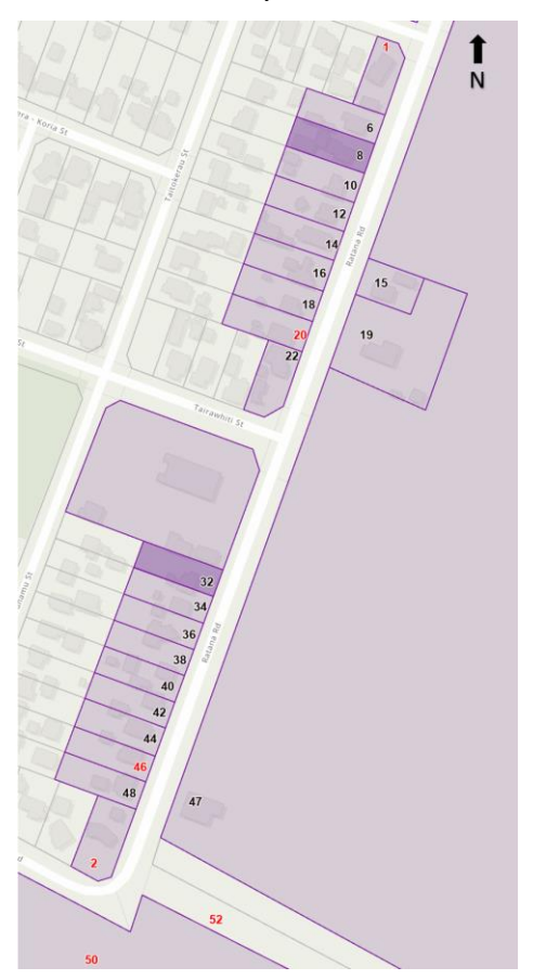
Figure 4: Properties on Rātana Road to be renumbered.