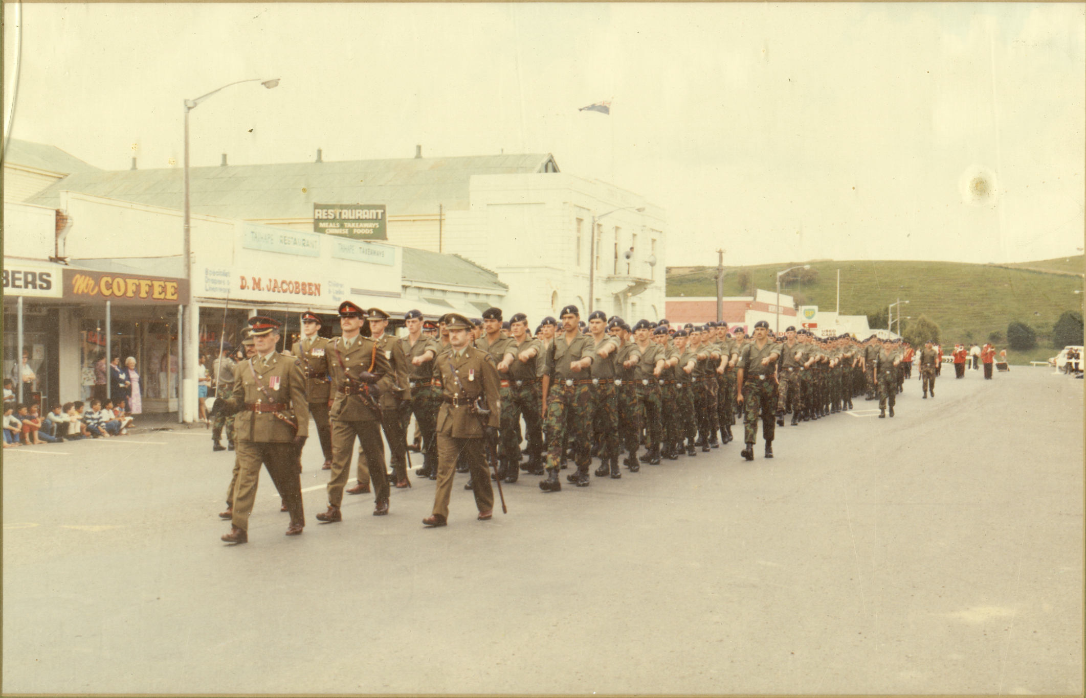
FREEDOM OF THE BOROUGH TAIHAPE 6 December 1985