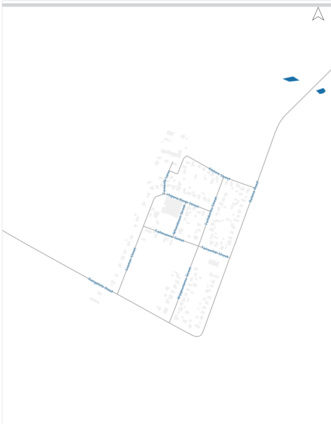
14 RĀTANA PĀ CIVIL DEFENCE COMMUNITY RESPONSE PLAN