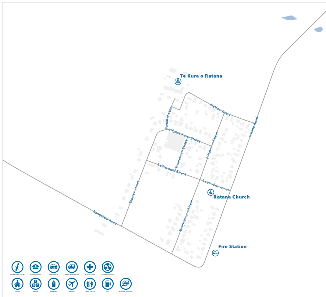
RĀTANA PĀ CIVIL DEFENCE COMMUNITY RESPONSE PLAN 5

The community can easily be cut off from the outside by flooding, slips and trees over the road and damaged bridges.