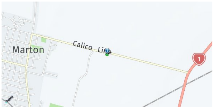
Address Line 1, State/Province, and Postcode are required. Country must be New Zealand