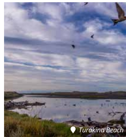
📍 Turakina Beach