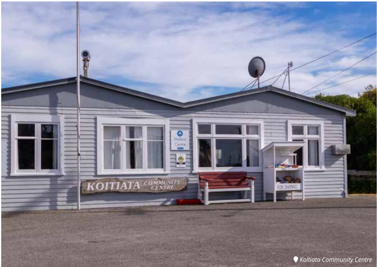
📍 Koitiata Community Centre