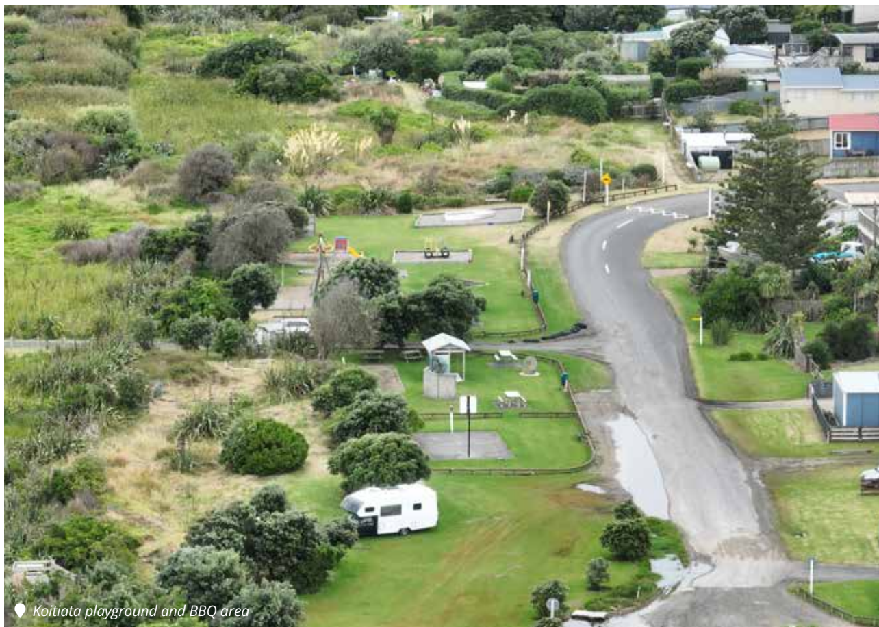
◆ Koitiata playground and BBQ area