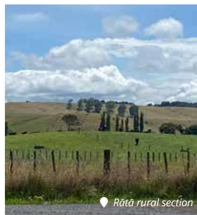
📍 Rātā rural section