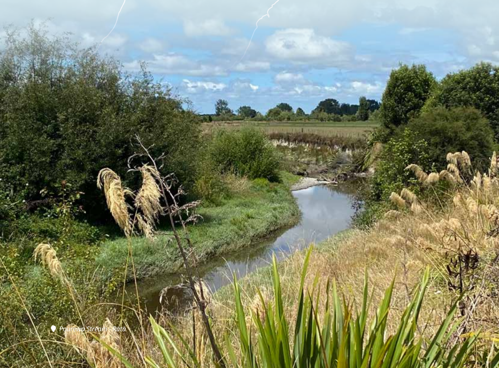
📍 Pourewa Stream - Rātā