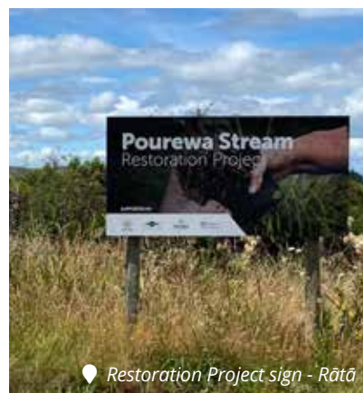
📍 Restoration Project sign - Rātā