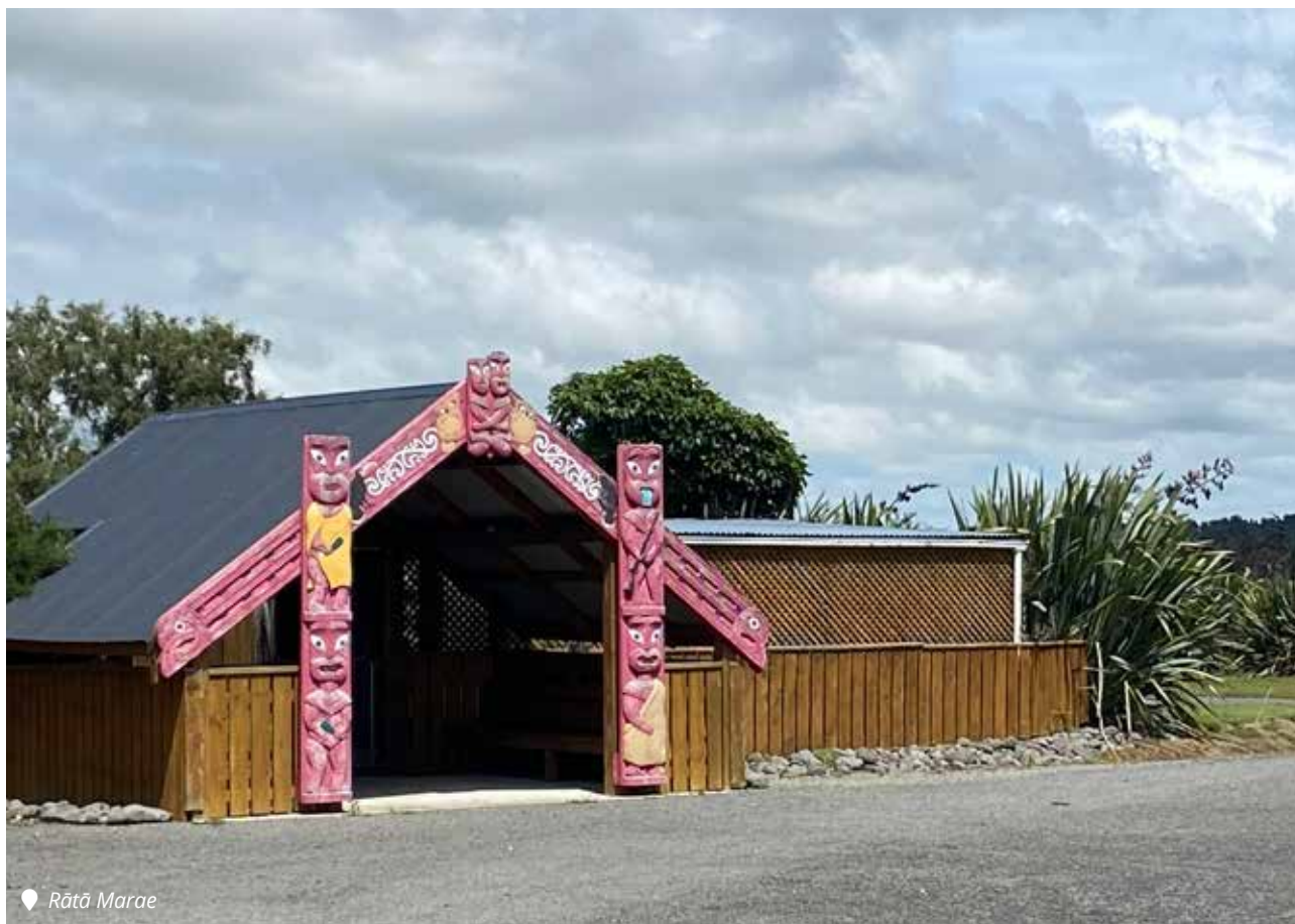
📍 Rātā Marae